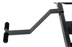
Hi-Lo T-Bar Buffer ($)(7-TBR4000)