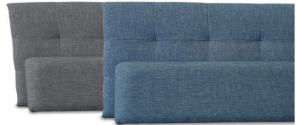
Upholstered ($) Jersey Headboard & Plain Footboard