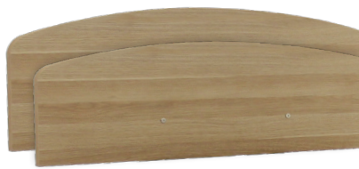
Laminite Curved Style Headboard & Footboard