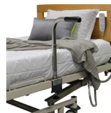
StandEzy Hook Handle Pole ($)(7-SE-HH)