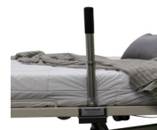
StandEzy Straight Handle Pole ($)(7-SE-SH)