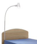
Reading Light ($)(7-ABSL)