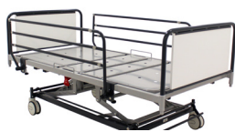
Horizontal Rails ($)(7002HR)