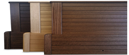
Timber ($) Eltham Style Headboard & Footboard

Stocked Colours: (colours are an indication only and may vary)