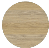
Laminite Natural Oak

Stocked Colours: (colours are an indication only and may vary)