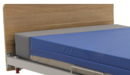
Foam Bolster ($)(7-BLR)