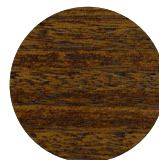
Timber Burnt Walnut